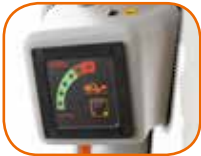
Load Stability Indicator