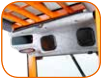
Radio Ready Kit