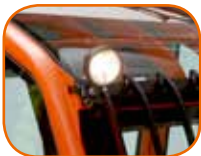
Cabin Work Lights