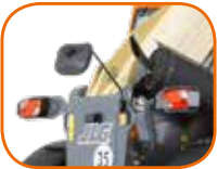
Rear Road Lights