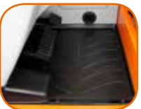
Non Slip Floor Mat