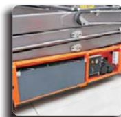
Removeable Battery Cover