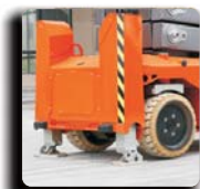
Automatic Leveling Outriggers