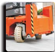
Compact Turning Radius